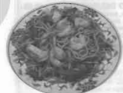
House Special Lomein