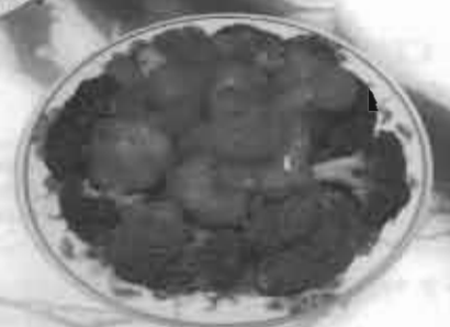
Shrimp w. Broccoli