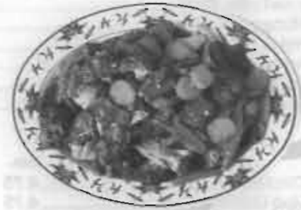
Beef with Broccoli