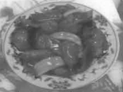
Sweet & Sauce Chicken